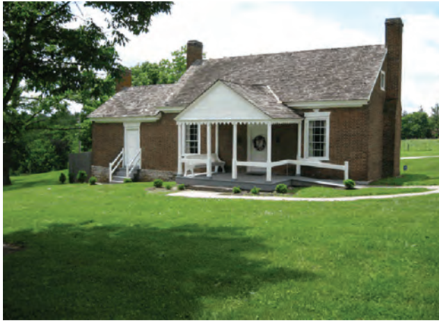
Above: The Jack Jouett House near Versailles, Ky., was Matthew Harris Jouett's boyhood home. Left: The painting in the home's dining room is a reproduction of an original self-portrait of Matthew Jouett.