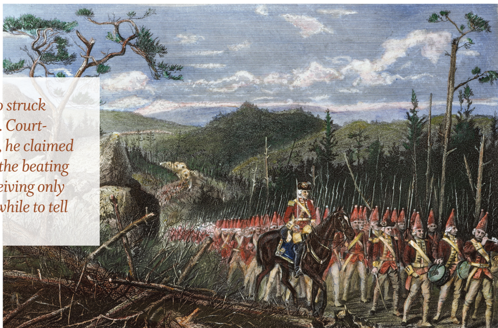
British General Edward Braddock marches to Fort Duquesne during the French and Indian War. Morgan drove one of the supply wagons.

Afterward, Morgan joined one of the Virginia ranger companies authorized by the Colonial Assembly to help protect the frontier from encroaching attacks by American Indian allies of the French. On the way back from leading a militia contingent through the backcountry near Winchester in 1786, Morgan