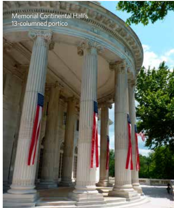
Memorial Continental Hall's 13-column portico

By the time the First Continental Congress convened on February 22, 1792, at the Church of Our Father in Washington, D.C., the National Society was stronger than ever. In her opening