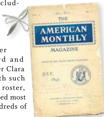
An 1892 issue of DAR's first national publication and precursor to American Spirit

With its focus on service, the National Society soon began attracting an illustrious group of women to its membership, including Progressive leaders such as suffragist Susan B. Anthony, temperance reformer Frances Willard and Red Cross founder Clara Barton. Even with such an accomplished roster, DAR leaders seemed most proud of the hundreds of