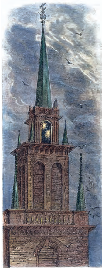
The spire of Old North (Christ) Church in Boston in which two lanterns glowed on the night of April 18, 1775, as a signal that the British were leaving Boston by water.

After the battles at Lexington and Concord, Revere spent 17 days—April 21 to May 7, 1775—on the road doing what was described as "out of doors work," this time for the Committee of Safety.