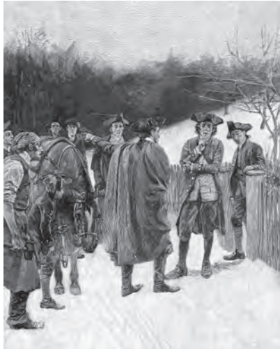
After arriving on horseback from Boston, Paul Revere warns Maj. John Sullivan at Durham, N.H., of British plans to occupy the fort and harbor at Portsmouth, N.H., December 13, 1774.

continue instead of arresting the rebellious Bostonians. Perhaps he was protecting his highly placed source or likely he was trying not to provoke a further rebellion. He may have worried that others would take the place of those he arrested, and the alarmed remaining leaders would improve their security.