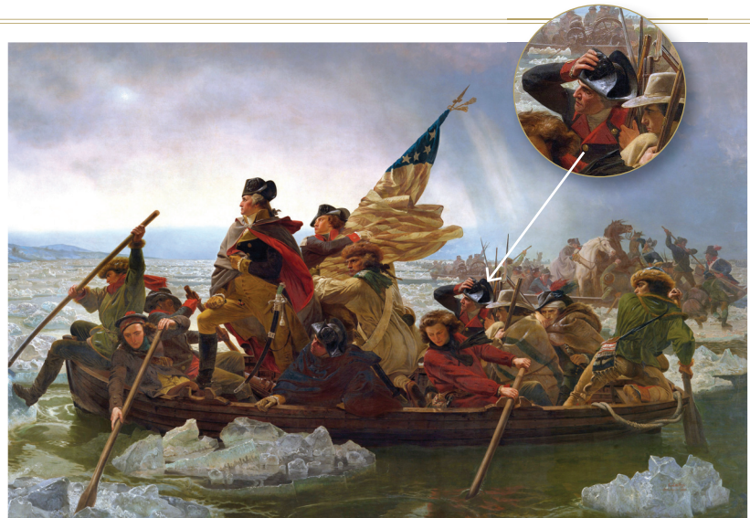
In Emanuel Leutze’s iconic 1851 painting “Washington Crossing the Delaware,” Edward Hand is seated behind Washington in the lead boat, holding his hat to his head. Despite the artwork’s beloved status, it is historically inaccurate: Witness the Stars and Stripes, which was first flown in September 1777, well after the December 25, 1776, crossing.

After a series of embarrassing incidents—including the so-called Squaw Campaign, in which an attack by Hand’s men on a Delaware American Indian village brought only the death of one old man, four women and a boy, and the capture of two women—Hand asked to be relieved of his command. Congress voted to accept Hand’s resignation, though Washington did so reluctantly, saying, “I esteem him an officer of great worth and merit.”